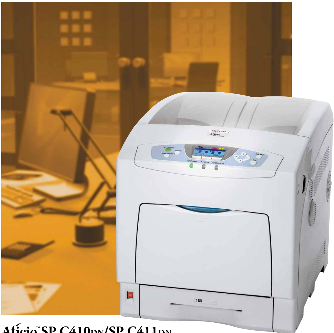
Aficio™ SP C410DN/SP C411DN