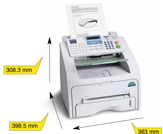
These powerful laser communication systems fit onto the smallest desk without intruding on work space.