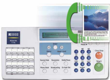
Operating the FAX1130L/1170L is straightforward and faxes are transmitted in seconds.